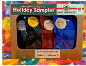
Sampler – 4 pack (Regular, Decaf, Peaberry, Christmas Traditions)