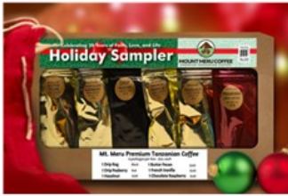
Sampler – 6 pack (Butter Pecan, Choc. Rasp., Regular, French Vanilla, Hazelnut, Peaberry)