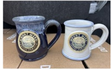
Hand thrown Mug (Blue or White)

The Mount Meru Coffee Project is celebrating a monumental 25th anniversary of ministry, a quarter-century of partnership with Tanzanian coffee farmers. Our Fair-Trade commitment has driven significant growth, now impacting the livelihoods of nearly 1,000 farmers and their communities. Get ready to welcome back the popular Christmas Traditions blend ($18 for bean or drip) and the versatile 4-pack ($15) and 6-pack ($20) samplers . Don't miss this year's new addition: a stunning, hand-thrown logo coffee mug ($20) —the perfect artisan companion for your coffee.