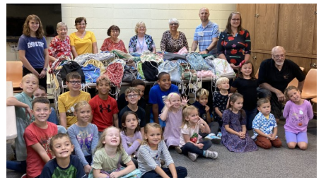
2024 school bags

Sunday School will pack the School Bags on September 21 during Sunday School time. We expect a very successful year and will have more than 160 bags filled. A final number will be published before the bags are shipped to Lutheran World Relief in October. From the LWR warehouse the bags go to school age children all over the world who benefit from your generosity.