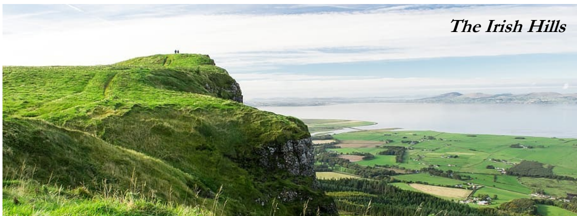
The Irish Hills