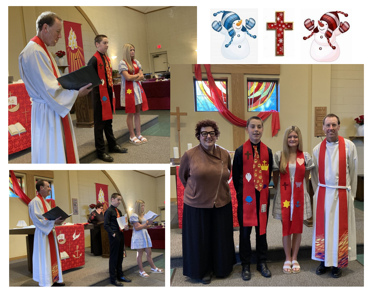
Page 11 Welcoming all, Worshiping God, Serving others