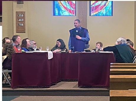
Living Last Supper, Maundy Thursday, March 28th