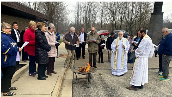
Easter Vigil, Saturday, March 30th