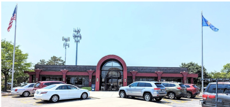
Martyr Monthly—St. Stephen the Martyr