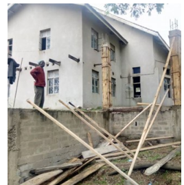
Canaan Parish building expansion.