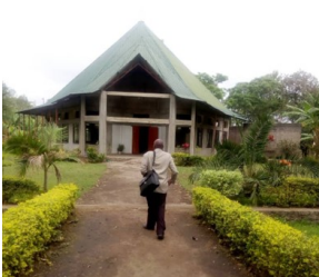
Jericho parish completed building and interior altar area.

We continue to support 3 students from Mbaaseny and these 2 sub-parishes with secondary school tuition fees. This support provides not only schooling but boarding and meals. With the continuing drought conditions, food expenses continue to be a challenge for all. While some rain has arrived, new seed and more rain is needed for crops to provide food for so many. Your support for our partner is appreciated. Please indicate the area of support with any gifts shared. Our next wire transfer will be sent in early January. For more information on this partnership, please contact Julie Starks, ja-starks39@gmail.com Asante sana!